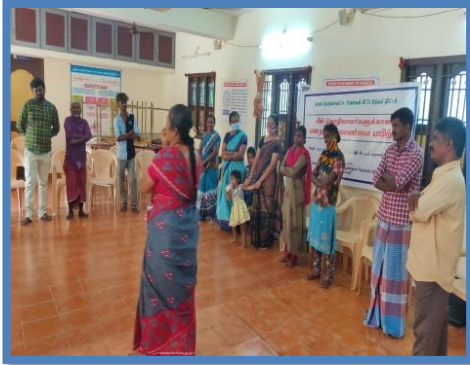
Mental health training to mill workers