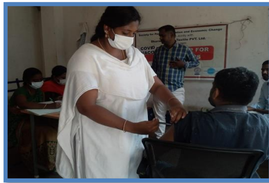
Vaccination camp in Dharmarathina mills