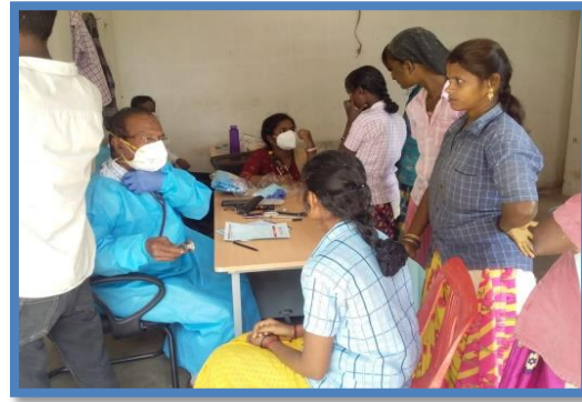
Medical camp jointly with Meenakshi mission hospital