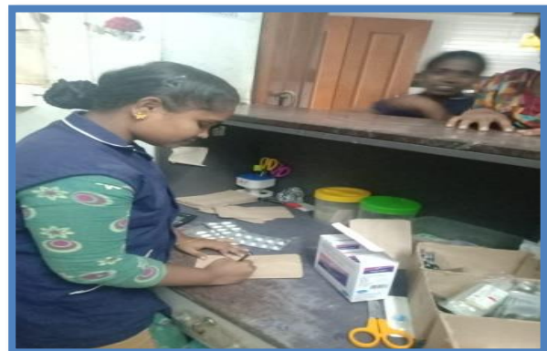
Employable Skill Training – Union office