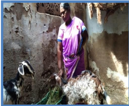
Goat rearing support from through union office