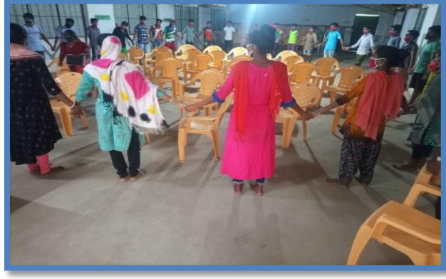
Life skill training to migrant workers