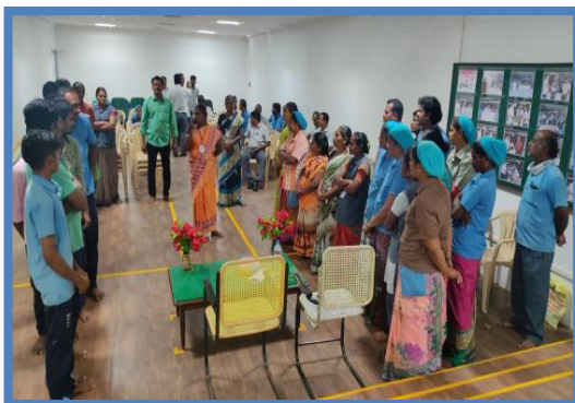
Mental health training to mill workers