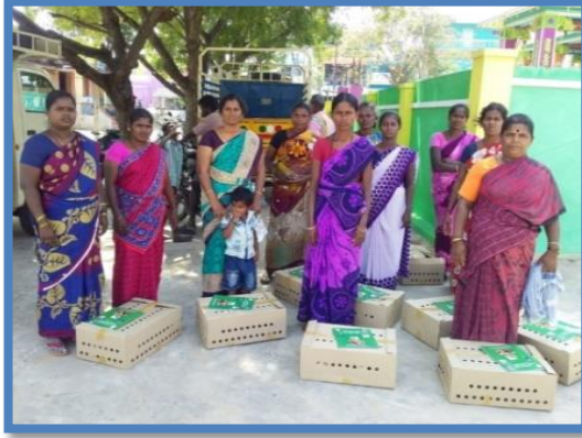
Livelihood support to vulnerable women