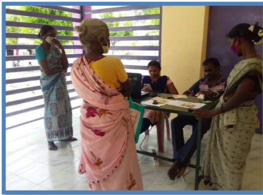
Registration Camp E-Shram