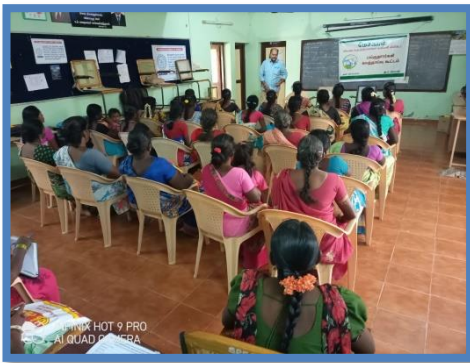
Producer company shareholders meeting