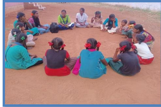
Adolescent girls meeting